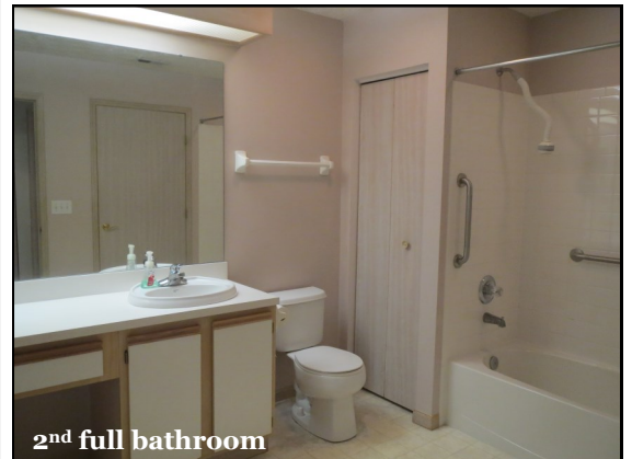
2nd full bathroom