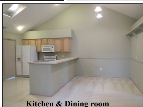
Kitchen & Dining room