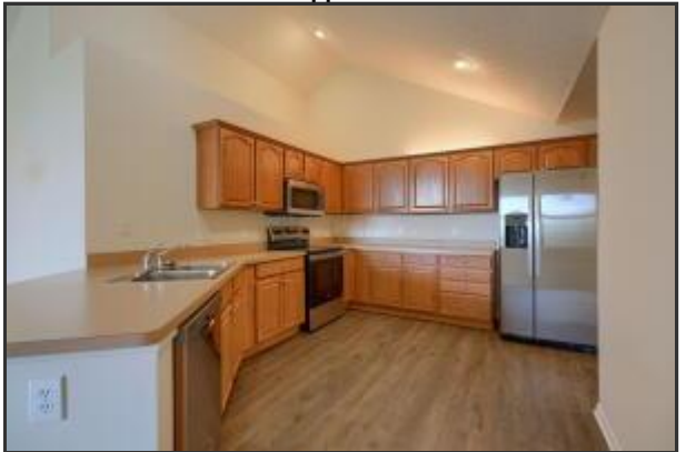
NEW refrigerator & range